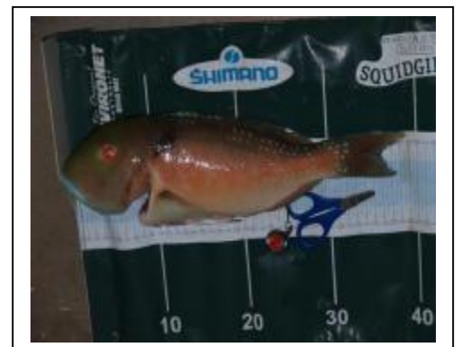
SOME OF THE FISH ON THE RULER