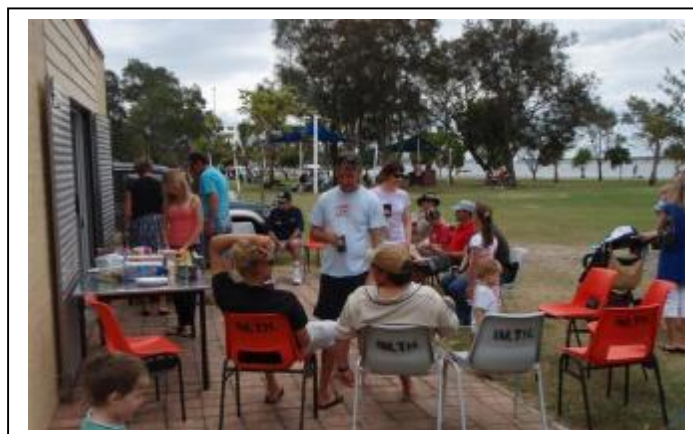
BBQ day after the October Comp

Competition dates are Saturday 15th and Sunday the 16th November with the BBQ on 12pm-1pm.