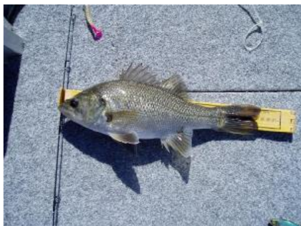
Bass from the Hinze Dam