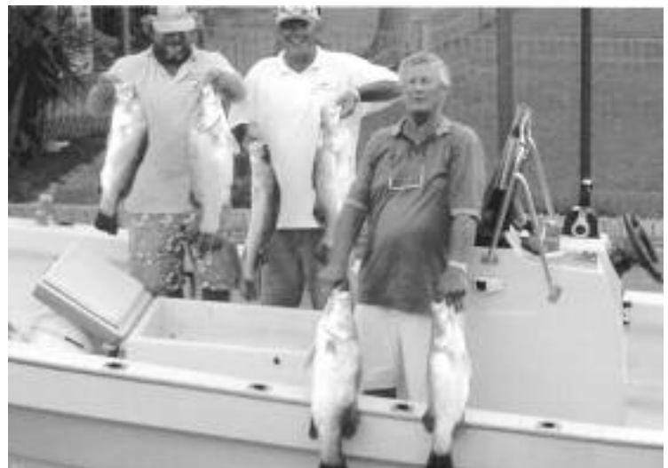
Crocodile Creek Barra