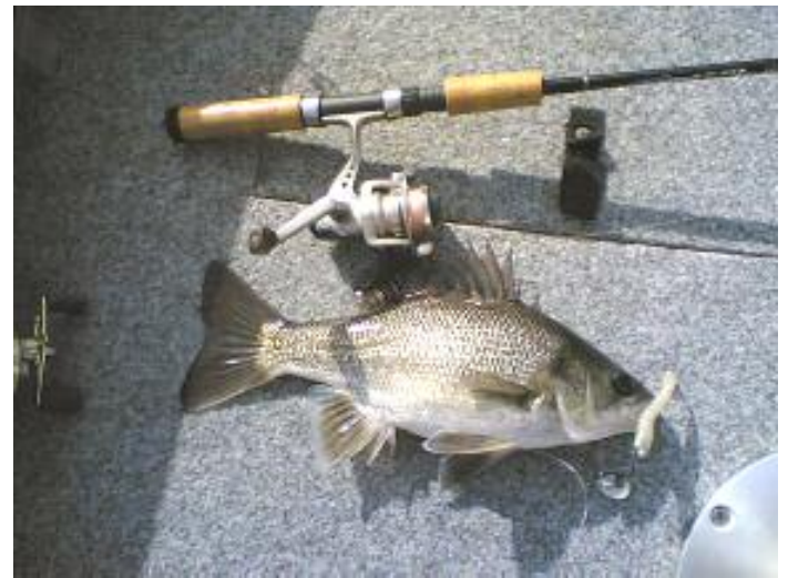
Jamie's Hinze Dam Bass

The guy just thought he'd run the line out to retighten the line on the spool, with 60 metres of line out the back the fish hit like a Tuna peeling a further 20-30 metres of line from the reel before being landed. I think I'm going to Big W next trip. My new GL2 G-Loomis needs to be blooded so to speak. Cheers Jamie.